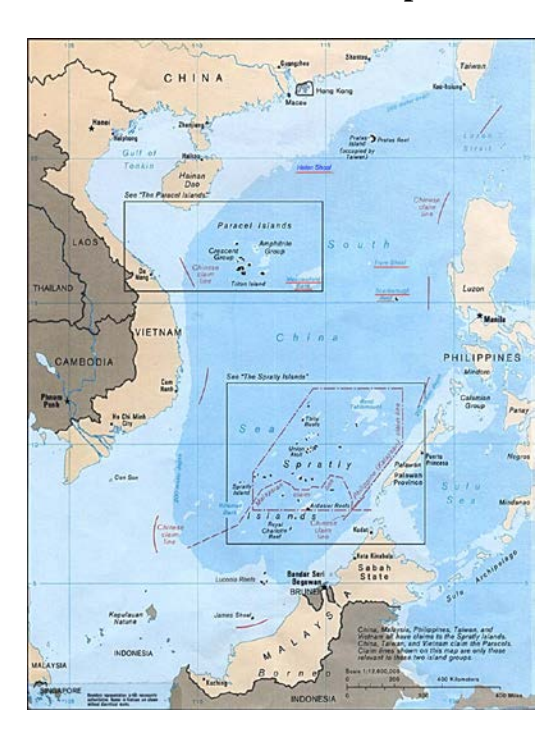
Figure 2: Map of South China Sea Dispute<sup>48</sup>

For the past century, several sovereignty states have laid claim to an overlapping territory in the South China Sea. The South China Sea is one of the busiest international sea lanes in the world, which described as "the throat of global sea routes of the world". <sup>49</sup> The SCS is essential to East Asia and its claim states due to its natural resources, maritime strategic sea lane and associated territorial disputes. However, activities in the SCS are not only related to trade and maritime navigation, but also exploitation and exploitation of natural resources such as natural gas, oil and fish stocks. Four ASEAN countries: Malaysia, the Philippines, Brunei and Vietnam, and the People's Republic of China (PRC), the Republic of China (ROC/Taiwan) lay overlapping claims to the South China Sea, and form the core of a territorial dispute.